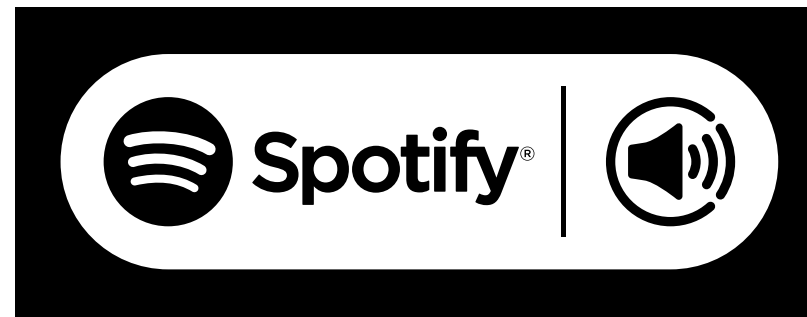
Sticker - Dark background