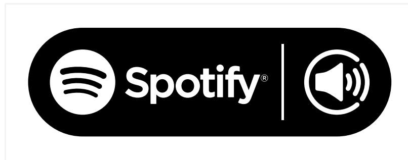
Sticker - Light background

Use the black & white Spotify Connect Compatibility logo. The logo includes the surrounding line and cannot be used without that shape.