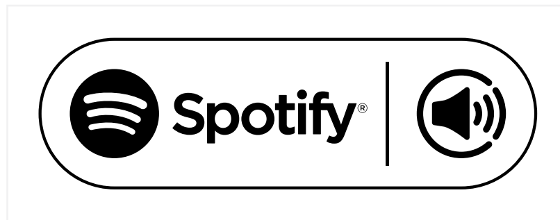
Black & white - Light background