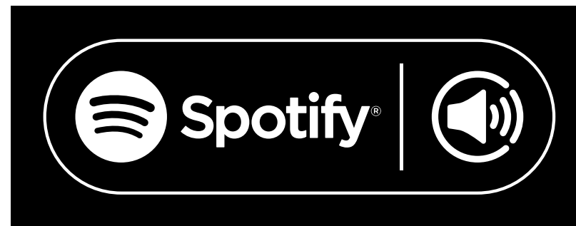
Black & white - Dark background